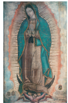
Our Lady of Guadalupe is the Patroness of the unborn, the Americas, and the Knights of Columbus.

Your participation in the Silver Rose program, especially your prayers and pledge for life, are a crucial part of our mission to defend and support life in every stage and condition.