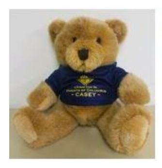
Casey the Teddy Bear